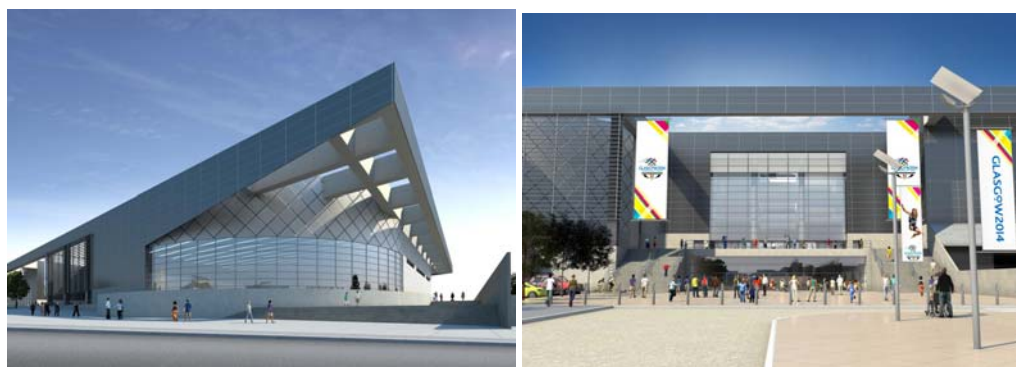
Sir Chris Hoy National Indoor Sports Arena

This venue is the replacement for the Kelvinhall International Arena and if all plans go well then our event will be staged in the new arena.